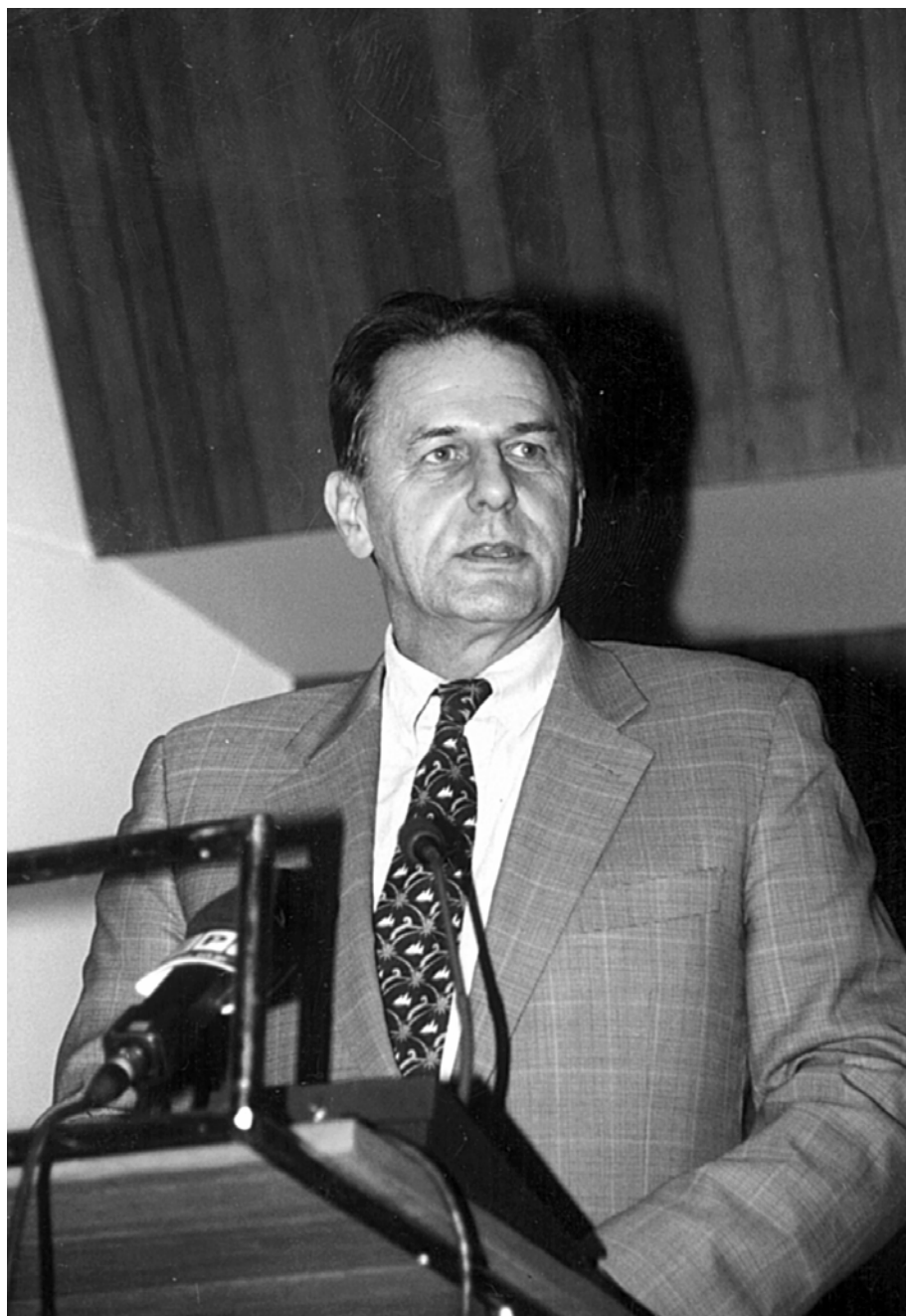
Address by the President of the International Olympic Committee, Dr. Jacques ROGGE.