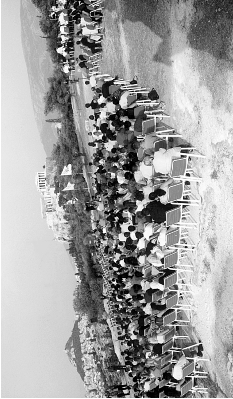
View of the Session's Opening Ceremony on the Pnyx.