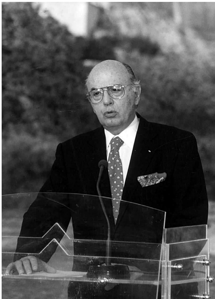
Address and opening of the 42 nd International Session of the International Olympic Academy by Mr. Lambis NIKOLAOU, President of the Hellenic Olympic Committee, Member of the International Olympic Committee.