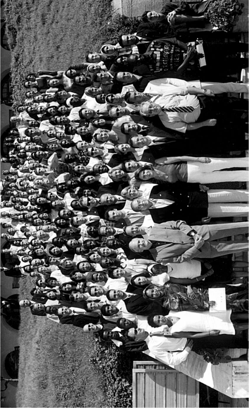
The typical commemorative photo at the Main Stairs of the IOA.