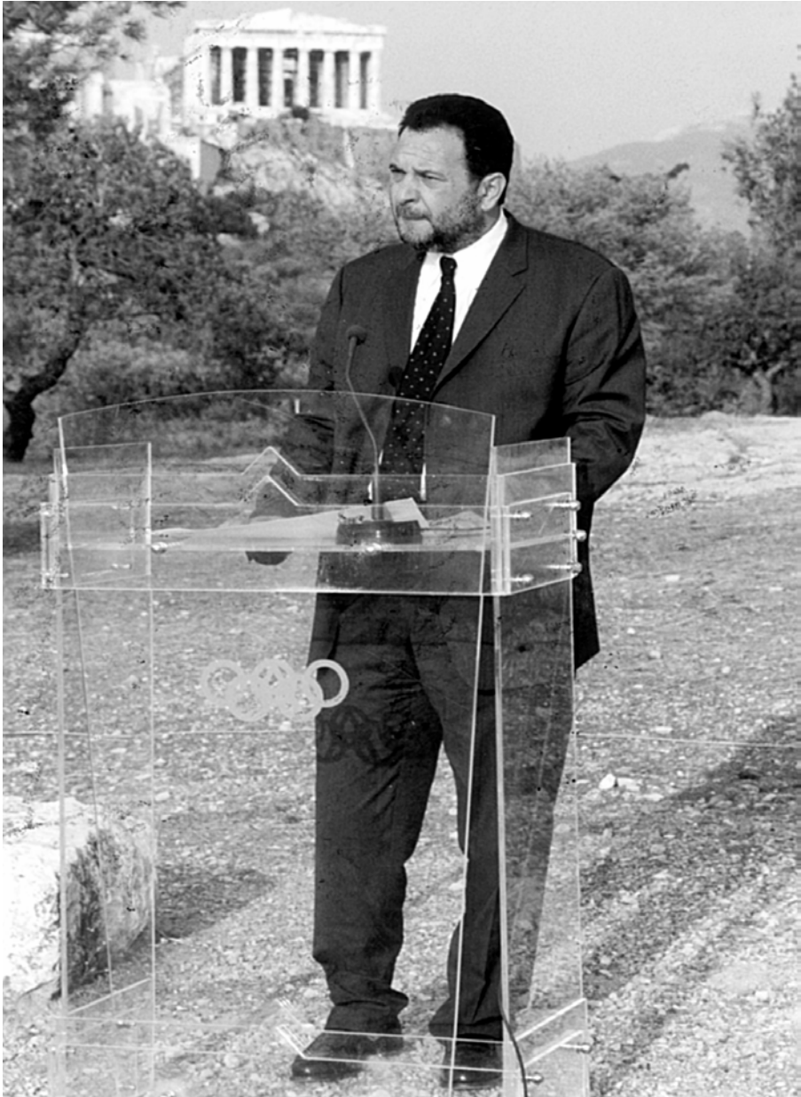
Mr. Yannis KOURAKIS, Deputy Minister of Culture with responsibilities for Sport, during his address at the Opening Ceremony.